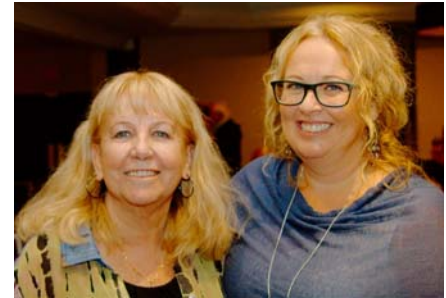
Our fearless leaders for 20 years (and counting)